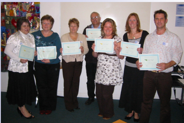
WCCN's first group of community groups to be accredited by ILCM

WCCN now offers ILCM to all its VCO members. He says, "Our deprived neighbourhoods programme has principally benefited from this approach, but we have also been able to offer ILCM Health Checks to many of our other VCOs."